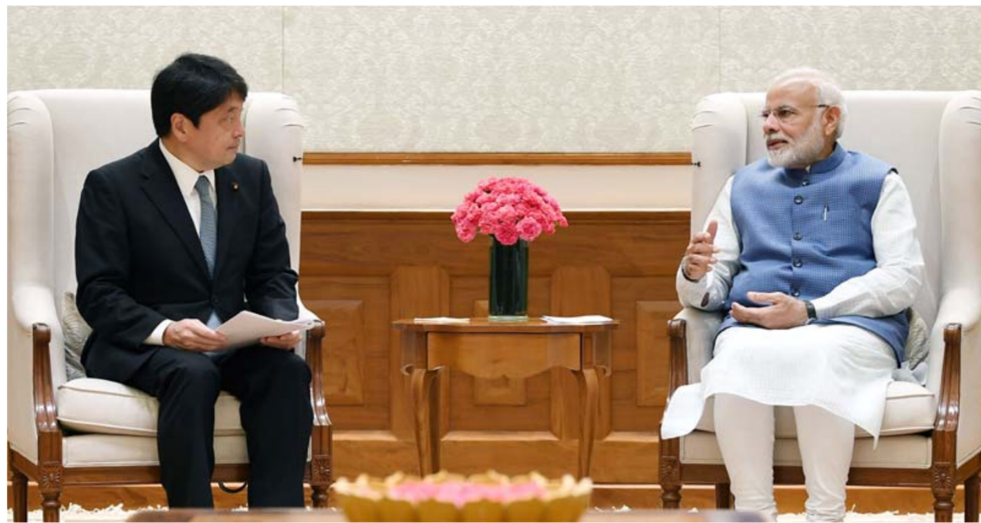
The Defence Minister of Japan, Mr. Itsunori Onodera calls on the Prime Minister, Shri Narendra Modi, in New Delhi on August 20, 2018.

"Wrong Number" follows three married couples whose lives are hopelessly entwined with confusions and suspicions. Avinash is having an affair with his boss Yashwant's wife Kamini and argues constantly with his own wife, Ranjana. It gets murkier when Kamini thinks that Yashwant, her husband, is having an affair. The plot thickens when each of the adulterous parties, plays host to Natwarlal Chaurasia & his wife Poonam at dinner parties on successive nights, both of which end in disaster.